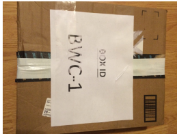
First box packed for Zambia!